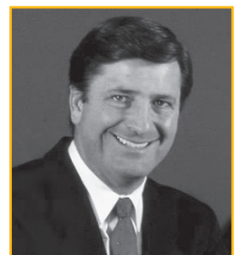
Keynote Speaker: California Lieutenant Governor John Garamendi

The CAUSE Community Building Luncheon is a fundraising event and, although this is a hosted event, guests will be presented with an appeal for donation at one point in the program. Of course, donations are not mandatory but are very much appreciated.