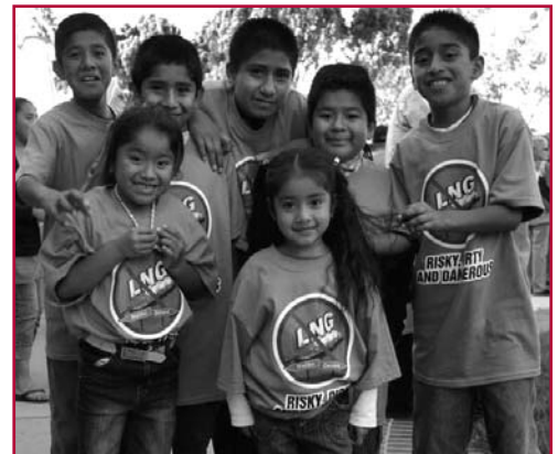
Children attending April 9th California State Lands Commission.

Since our formation in 2001, CAUSE has led successful efforts focused on living wage jobs, accountable development,